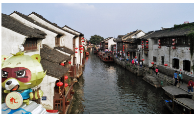
Figure 2: Suzhou Old Town , photograph by Glen Wash Ivanovic.

Today, Suzhou is one of China's most dynamic and rapidly developing cities. Suzhou is part of the Yangtze River Delta megalopolis, which accounts for a fifth of China's GDP. Once known as the city of silk it has become the centre of wedding dress production, selling paradise on earth for one day, including copies of the last royal wedding dress, out of shops at the foot of mythic Tiger Hill 虎丘 [Hǔqīū]. Suzhou is also the host of what is known as the Silicon Valley of the East. It has attracted millions of migrants searching for a better future; millions of tourists visit every year to experience the past, strolling through the gardens and courtyards of its Old Town. The contrasts could hardly be more apparent. Slow time, and fast time, and the time of the in-between, are woven into the city's complex spatial fabric.