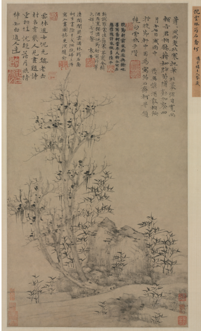
Figure 12: Bamboo, Rock, and Tall Tree 筠石乔柯, c. 1300s, by Ni Zan 倪瓒 (1301–1374), Yuan Dynasty. Hanging scroll, ink on paper; 67.3 x 36.8 cm. The Cleveland Museum of Art, Leonard C. Hanna, Jr. Fund 1978.65.

ars began to develop Buddhist philosophies during the Disunity period. Hermits and travelers depicted the natural landscape in poetry and painting, while private gardens were constructed for them to experience artistic features in three-dimensional space.