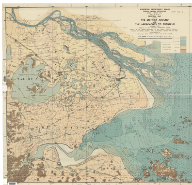
Figure 3: Map from 1920 of the Yangtze River Delta with Suzhou to the east of Lake Tai. Virtual Shanghai image collection ID 233.

The waterways in the old city were designed with parallel streets with courtyard houses between the two. The traditional courtyard houses have a line of halls and courtyards that connect the street to the water's edge and floating markets would deliver directly to the houses. As China shifted from water to surface transportation, some of the canals were filled in but the water below ground is ever-present. In the second XJTLU Suzhou International Workshop (Feb. 2017) a group of participants walked around the northwest corner of the old city and counted fourteen water wells within a short distance, some inside the courtyard houses and some in the streets creating "water spots" or mini public spaces for outdoor cooking, mini gardens and public washing. Suzhou's water landscape of rivers, canals, water streets and lakes enters the famous walled gardens which are mostly formed around a central body of water.