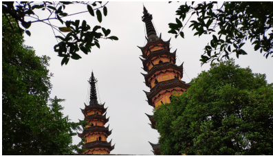
Figure 10: Suzhou, Twin Pagodas

Zhejiang, Jiangxi, Hubei and Jiangsu which includes Suzhou (Penang San Kiang Association, 2020). Compared to other Malaysian Chinese subgroups, this is by far the smallest. Despite the number of this community, the first association was formed in Penang in 1897 and named San Jiang Clansmen Association to preserve their heritage and identity in what was then a new environment.