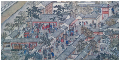
Figure 1: Prosperous Suzhou 姑苏繁华图 [Gūsū Fánhuá Tú], clipping, by Xu Yang 徐扬, 1759. Handscroll, ink and colors on silk, 35.8 x 1225 cm; Liaoning Provincial Museum, Shenyang.

Once called paradise on earth, famous for its gardens and its exquisite silk garments, historic Suzhou is kept alive in poetry and painting. Famous examples include the 18th-century scroll Prosperous Suzhou originally entitled Burgeoning Life in a Resplendent Age . The painting, commissioned by the Qianlong Emperor 乾隆帝, records life crossing the threshold into the modern age, in a traditional Chinese style that incorporates the Western perspective.