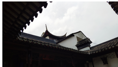
Figure 6: Suzhou, courtyard of the Shadow Garden , photograph by Claudia Westermann.

The intuition to reflect the dislocation of the modern and the traditional by identifying different spatial characteristics indicates a common lens: research studies have always analysed Suzhou in a framework of old versus new, tradition versus modernity, which also becomes the foundation for understanding and analysing Suzhou. However, there is no consensus regarding modernity and its meaning in Suzhou's modern history, nor any conceptual coherence of tradition in the radical societal transformation of Suzhou, which results in little attention paid to the relationship between tradition and modernity. Consequently, very few observers have questioned when Suzhou began to strive toward the modern. Looking back in time to the painting Along the River During the Qingming Festival , which depicts Suzhou's prosperity through lively scenes during Ming dynasty, we see numerous houses, shops, drama platforms, parade grounds, boats and merchant barges; the city seems never to rest. Economic growth stimulated the growth of Suzhou as