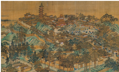
Figure 11: Tiger Hill , as seen on The Kangxi Emperor's Southern Inspection Tour , by Jiao Bingzhen 焦秉贞, ca. 1707. Handscroll, ink and colors on silk, 50.5 x 813 cm ( Catalogue of Chinese Famous Painting in Japan 1938, p. 294).

unique styles are broken down into six: Penang Style, Southern Chinese Eclectic Style, Early Straits Eclectic Style, Late Straits Eclectic Style, Art Deco and Early Modern (Zwain and Bahauddin 2019).