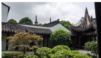
Figure 7: Suzhou, Shadow Garden with the Twin Pagodas in the background, photograph by Claudia Westermann.

网师园 [Wǎngshī Yuán], or Master of the Nets Garden, is located in the southern part of Suzhou's Old Town within the encircling square moat 外城河 [Wàichéng Hé]. It is a significant Song Dynasty (960–1279) example of the garden/house dynamic with several courtyards mediating between the complementary forces of residence and ritual. The house – with its largely Confucian orientation – is axial, hierarchical and somewhat symmetrical, while the garden is a Daoist space for free and easy wandering. House and garden are like two sides of the same coin – different but connected, complementary yet set apart, never fully revealed to each other. The American author Ursula K. Le Guin renders section 11 of Laozi's text in the following way: