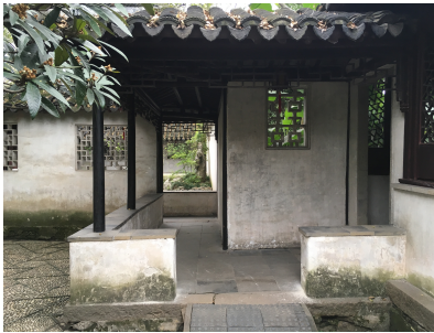
Figure 13: The Humble Administrator's Garden , photograph by Yiping Dong.

made on silk scrolls, never meant to be framed or hung). There is no difference between a painting and the landscape that it is meant to represent. Like a painting, a garden is also a palimpsest, a collective work of art that changes and is enriched over time. A garden is also a copy: Suzhou private gardens are small copies of the large emperor's hunting estates. Gardens reproduce in small-scale mountains and rivers. Their pavilions reproduce ancient architecture and buildings from faraway lands. So, if a painting is a portable garden, a garden is a domestic version of the world (Bosker 2013). It is a mnemotechnic device, a theatre of the world, a time-travelling machine, a paranoid-critical device to ward off the anxiety of living. A garden is a scientific tool for self-secluded knowledge workers, for the study and the observation of the world in a controlled environment.