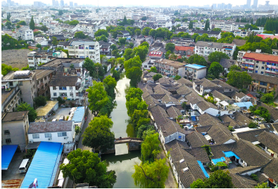
Figure 4: View of Suzhou's Sheng Jia Dai 盛家埭, through the old town and towards the New District, photograph by Glen Wash.

The gardens recreate natural Chinese landscapes in miniature, mountains and water 山水 [shān shuǐ], the general term for landscape. Diverting the waters and stacking stones were techniques that became essential to the construction of the Suzhou garden. Describing the Lingering Garden 留园 [Liú Yuán] (1593), Ron Henderson defines the lake as the heart of the garden fed by small waterfalls flowing out of the rockeries (Henderson 2013). The Humble Administrator's Garden 拙政园 [Zhuōzhèng Yuán] (1513-1529) is a strolling garden gathered around a body of water with